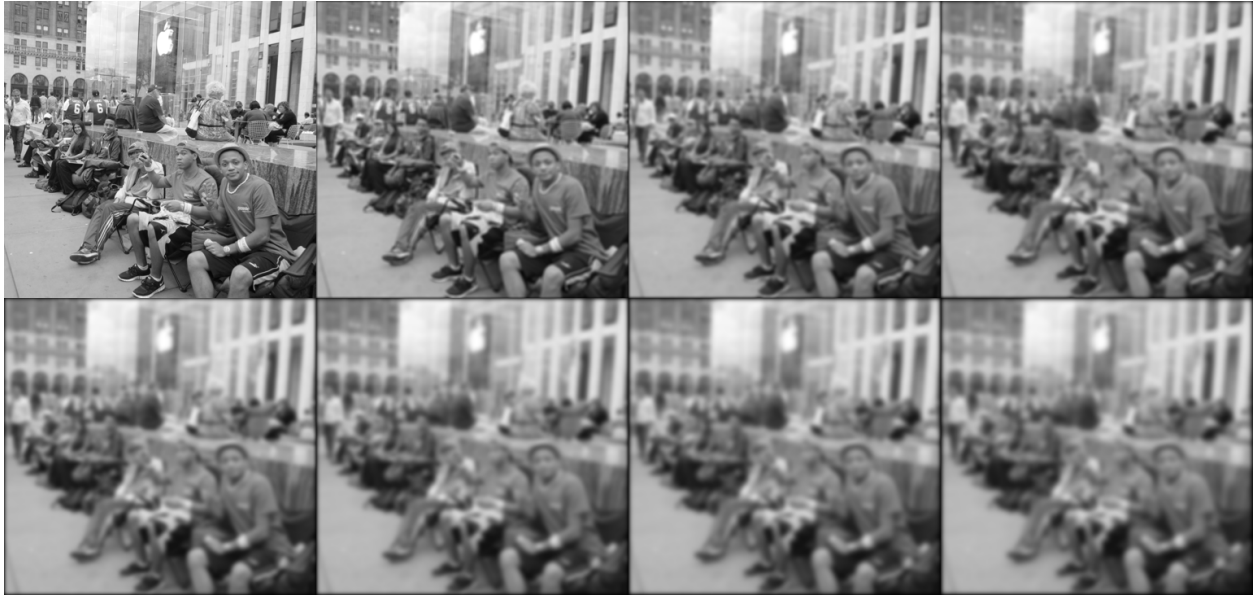
Figure 1: A Gaussian stack.