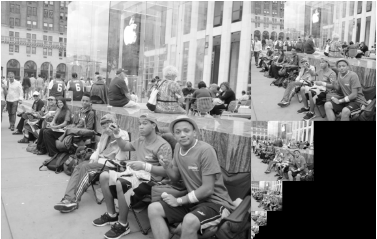
Figure 2: A Gaussian pyramid.