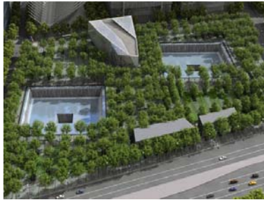
National September 11 Memorial

DO NOT SIT IN THE LAST FOUR ROWS! (sec 01) THREE ROWS! (sec 02)