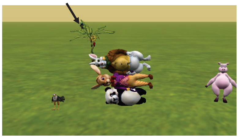
CompSci 94 Fall 2024 6