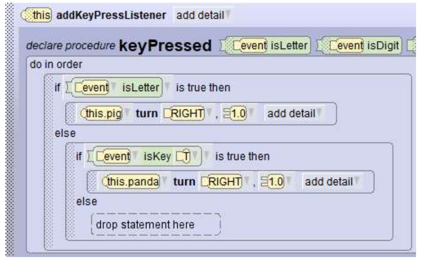
CompSci 94 Fall 2024