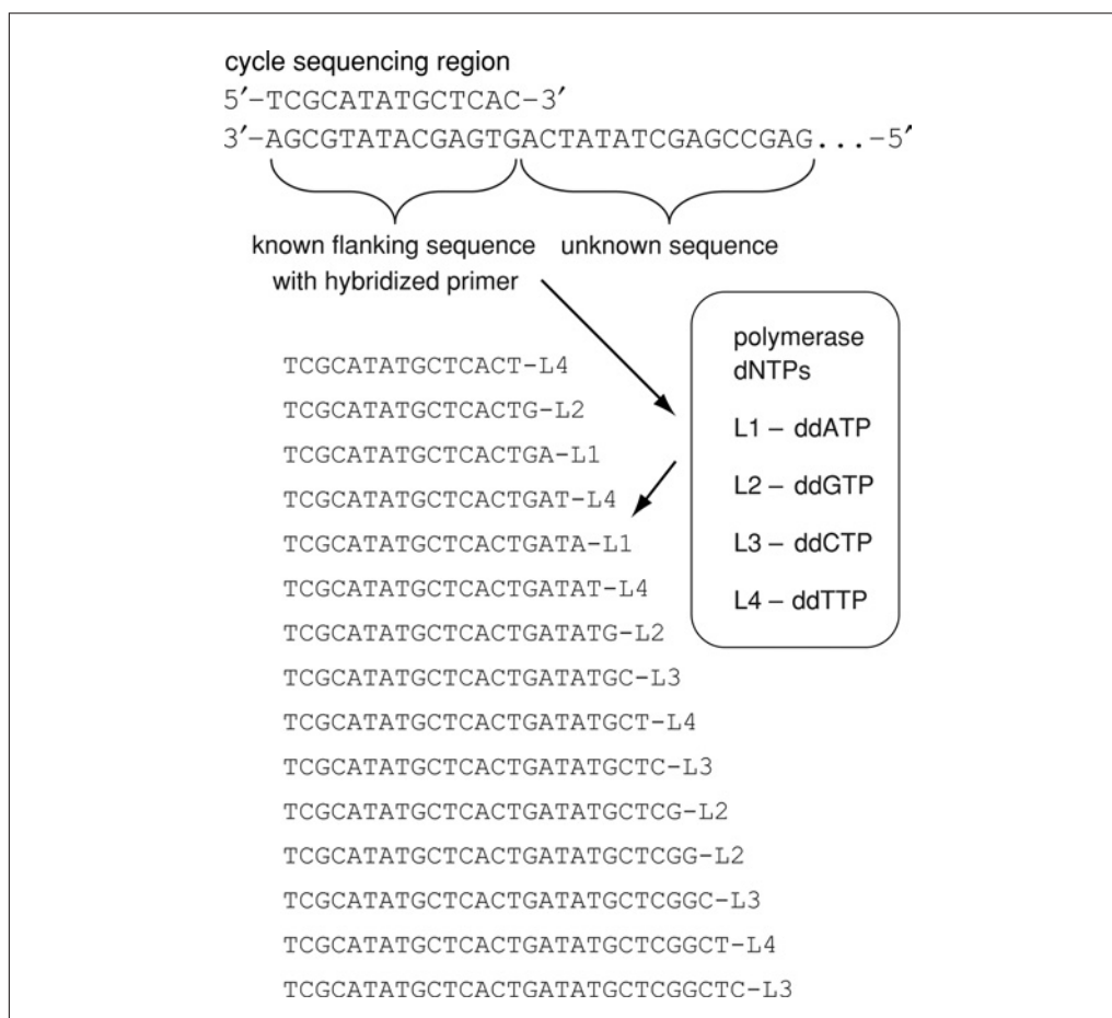
Figure 7.1.1 Schematic of the basic principle involved in dideoxy sequencing. The sequencing template consists of an unknown region whose sequence is to be determined, flanked by known sequence to which a sequencing primer can be hybridized. Cycle sequencing (multiple cycles of primer annealing, primer extension, and denaturation) are performed with polymerase, dNTPs, and fluorescently labeled ddNTPs (where a different label is present on each species of ddNTP). Products of the cycle sequencing reaction are run into a capillary containing a denaturing polymer. This yields size-based separation with single-base-pair resolution, with the shortest fragments running the fastest. Observation of the emission spectra in four channels (corresponding to the fluorescent labels for the four ddNTP species) over time, as fragments emerge from capillary electrophoresis, can be used to infer the primary sequence of the unknown template.

the use of engineered polymerases, such as ThermoSequenase, that are thermostable and that efficiently incorporate modified ddNTPs (Tabor and Richardson, 1995). The products of the cycle sequencing reaction are analyzed in an automated sequencing instrument via electrophoresis in a long capillary filled with a denaturing polymer that yields size separation with single-base-pair resolution. As fragments of each discrete length pass through a transparent component near the end of the capillary, a single wavelength of light excites the fluorophores linked to the ddNTPs. Labeled fragments fluoresce at one of four distinct wavelengths, revealing the identity of their terminal base via FRET. Simultaneous measurement of the emission spectra at these four